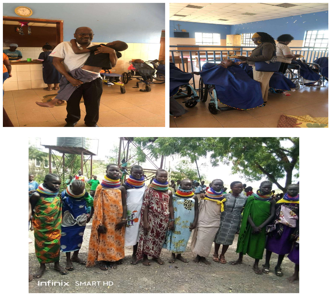
Figure 5:Special Groups